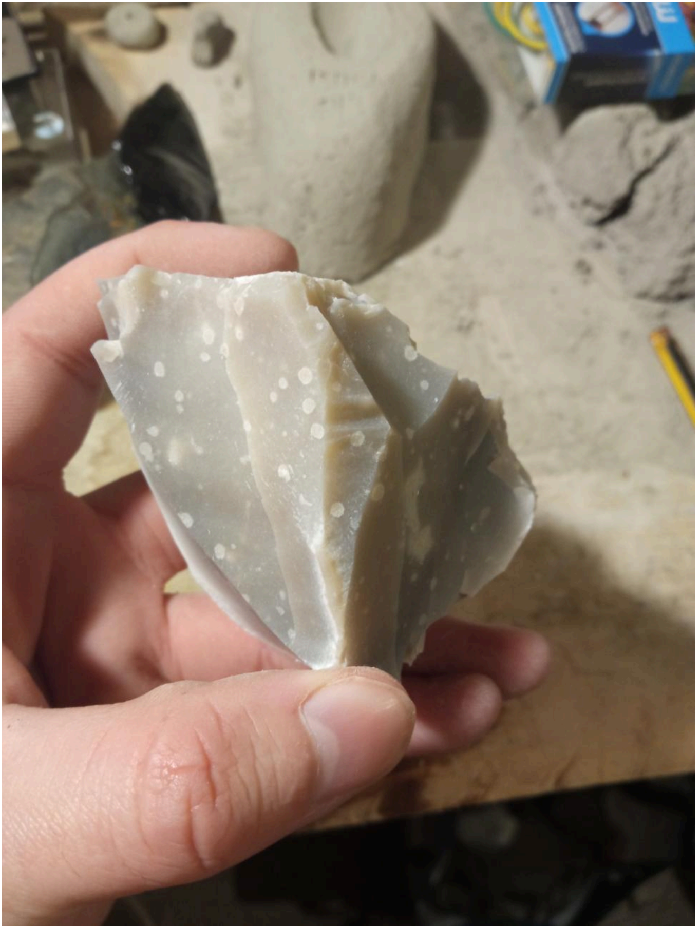
FIG 3. MAKING THE FLINT CORE REPLICA.