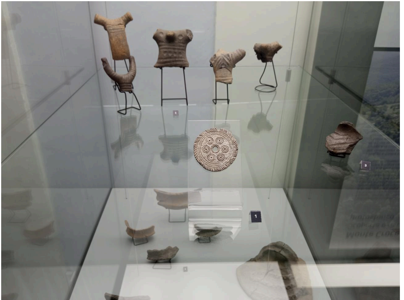
FIG 7. BRONZE AGE ARTIFACTS FOUND IN THE TERRITORY OF ARCEVIA.