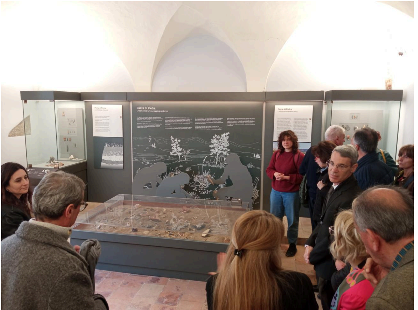
FIG 6. VISITORS DURING THE RE-OPENING OF THE MUSEUM ENJOYING THE NEW EXHIBITION.