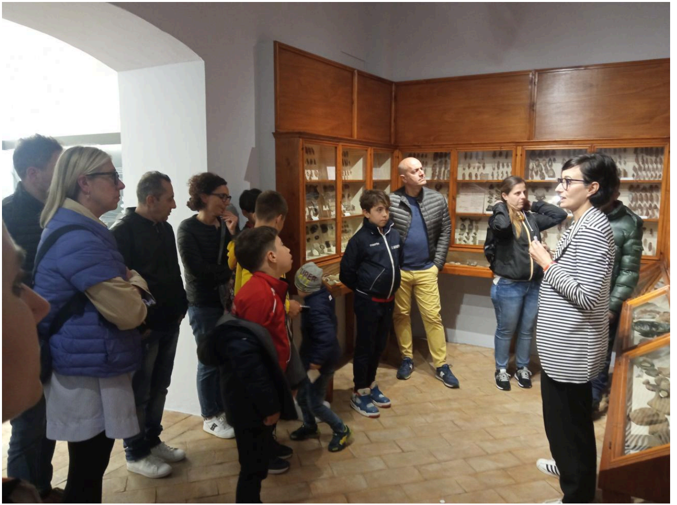
FIG 2. VISITORS DURING THE "MUSEUM NIGHT". PHOTO BY MAURO FIORENTINI