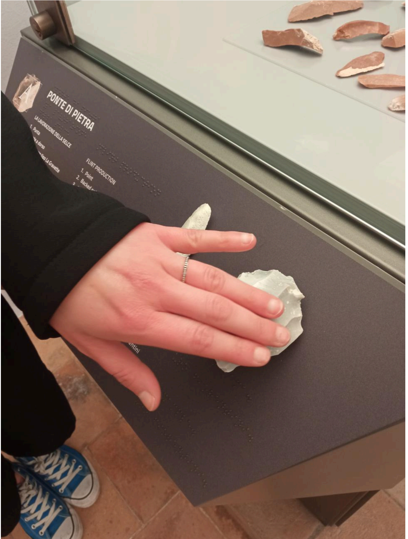
FIG 1. FLINT CORE REPLICA BEING ENJOYED BY VISITORS FOR THE FIRST TIME.