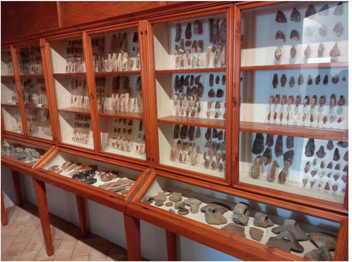
FIG 4. PART OF THE MONTI-ANSELMI WUNDERKAMMER.