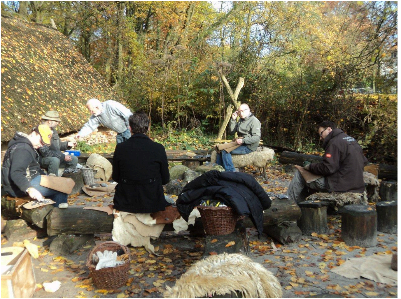
FIG 11. FLINT KNAPPING WORKSHOP