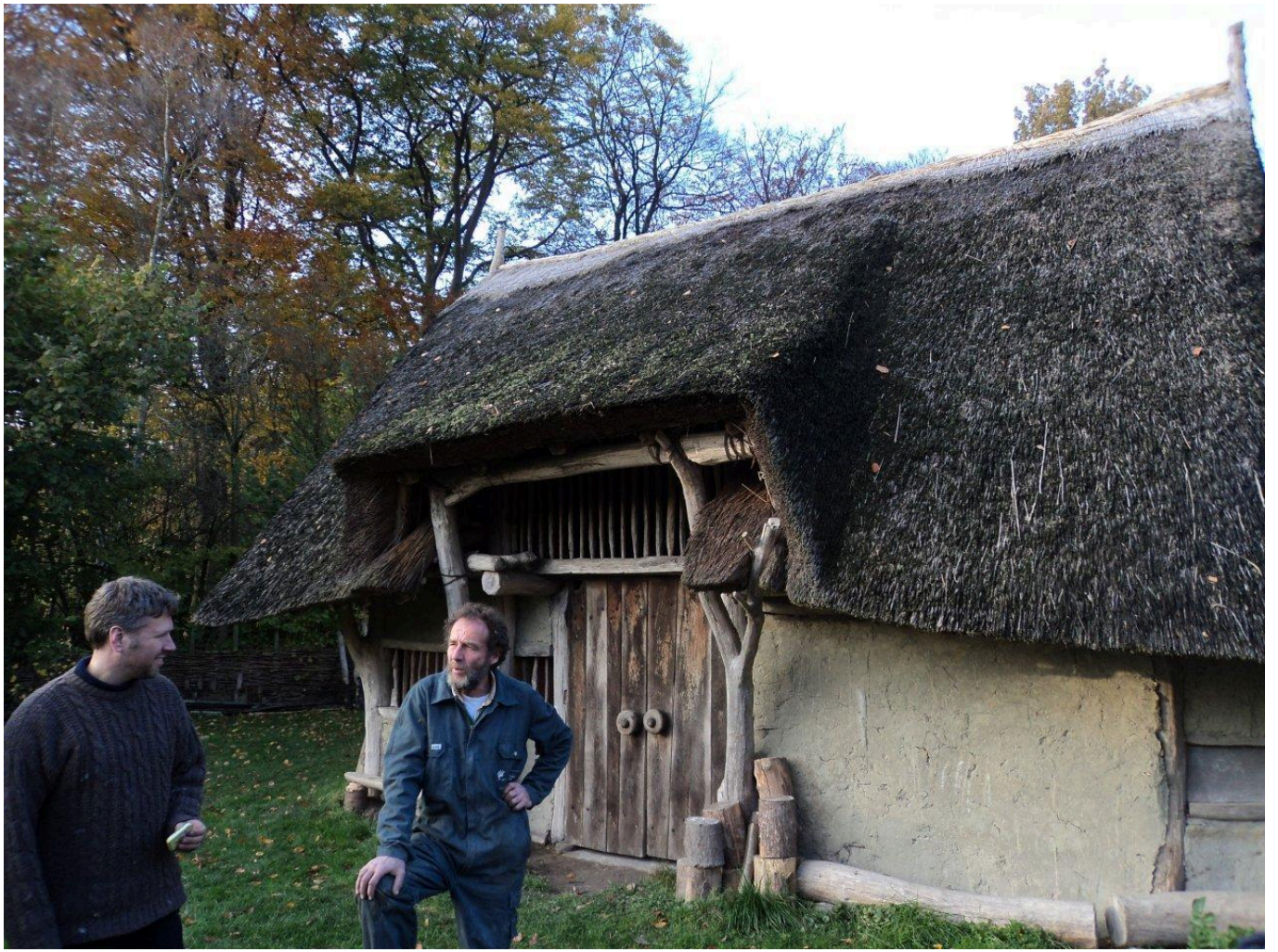
FIG 14. A LAST GLIMPSE AT WILHELMINAOORD, VAAE CELEBRATION