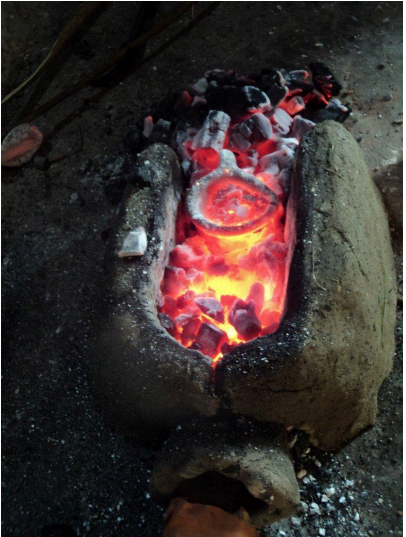
FIG 7. THE 'MELTING POT'