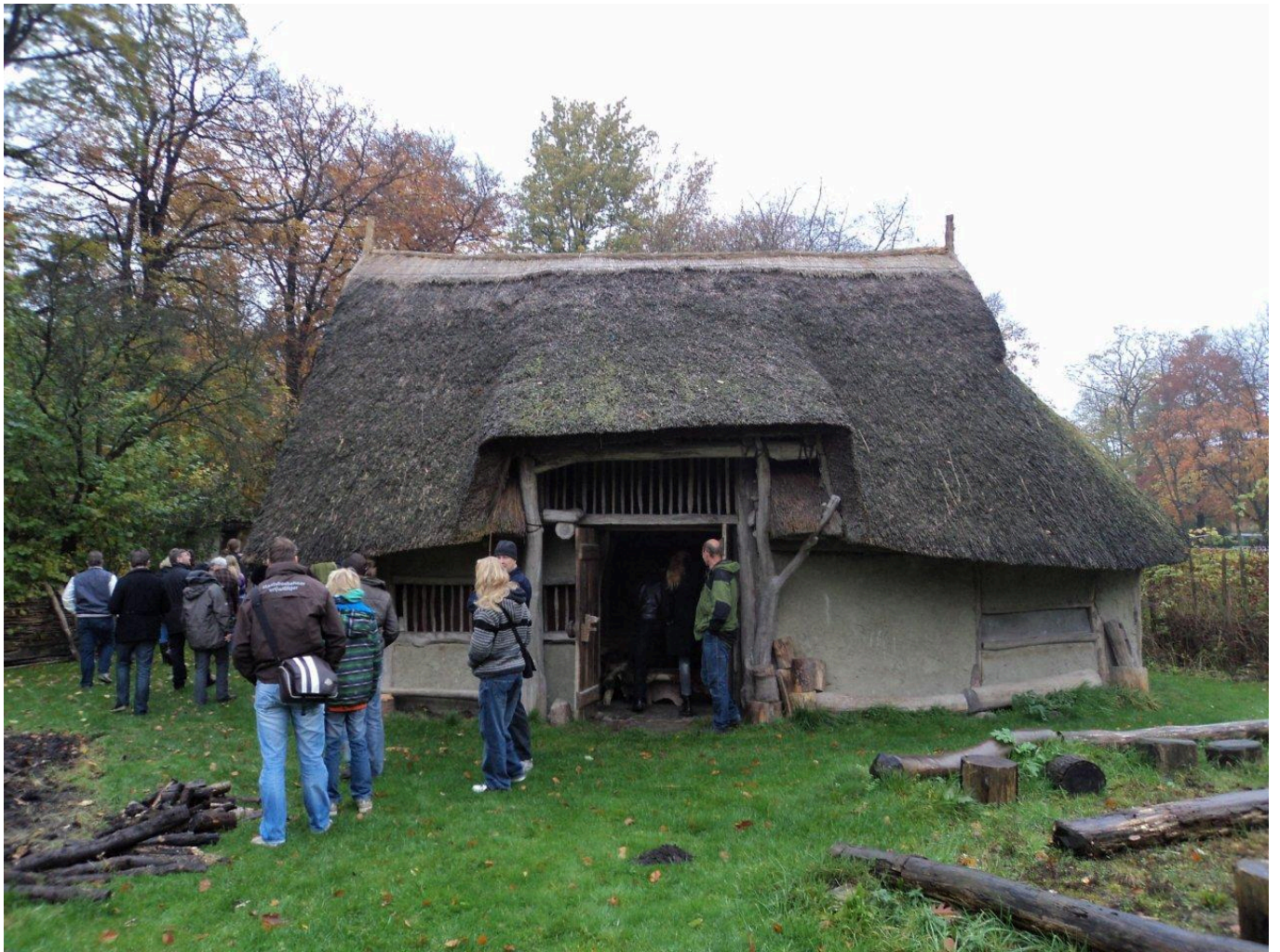
FIG 3. THE GUIDED TOUR THROUGH THE OUTDOOR AREA OF BUITENCENTUM WILHELMINAORD