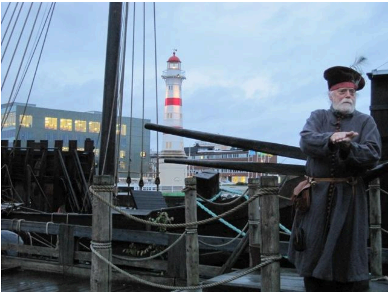
FIG 1. RECEPTION AT THE MALMÖ KOGG MUSEUM