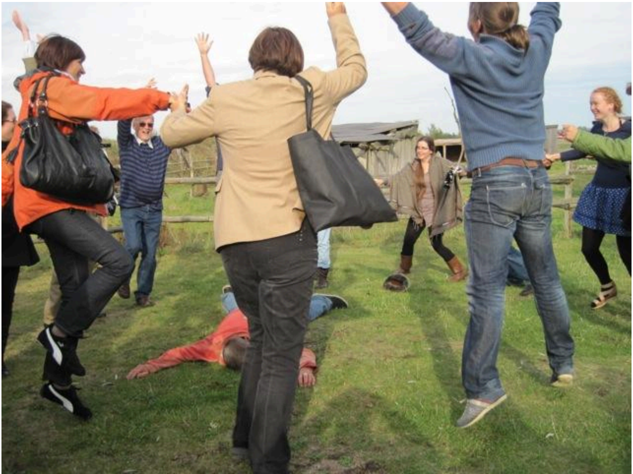
FIG 5. DANCING WORKSHOP AT FOTEVIKEN