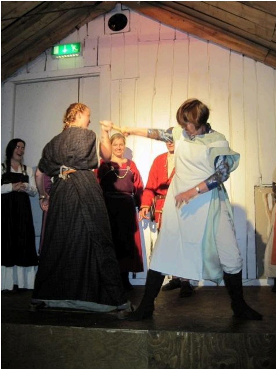
FIG 2. GAMES AT THE VIKING FEAST AT FOTEVIKEN