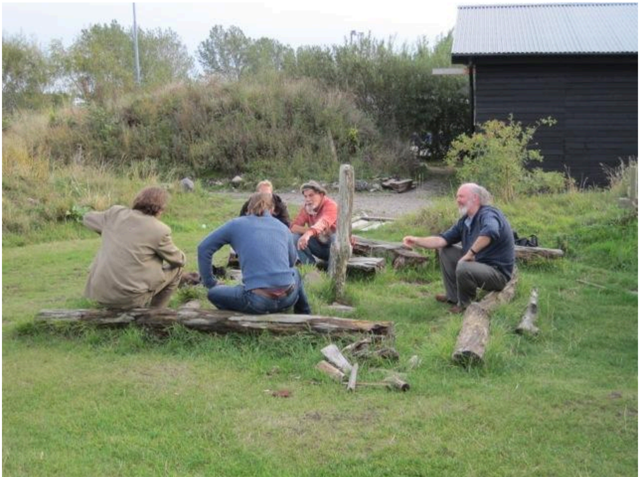
FIG 4. STORY TELLING AT FOTEVIKEN, SWEDEN