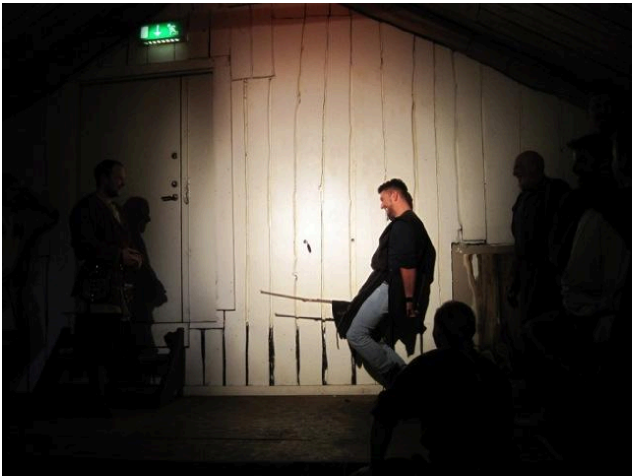
FIG 3. GAMES AT THE VIKING FEAST AT FOTEVIKEN